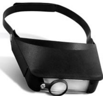
Lightweight head magnifier. Flip down loupe, built-in main lens and an inner auxiliary lens. Comfortable- adjustable velcro strap. $20