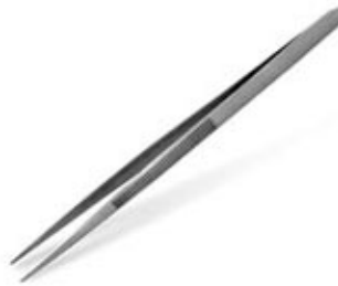
Tweezer Med-Point with Groove for Grip $10