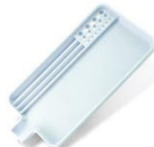
Sorting Tray Feature indentations grooves and a pour spout. $5