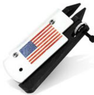
Easy Mount Gem Set Pliers $25