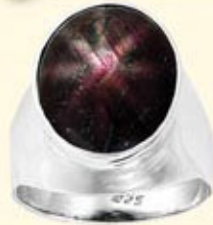
Mens .925 Star Ruby Sterling Silver Ring

SJTA • All GL&W Shows/JCK Las Vegas AGTA Section • AGTA Tucson