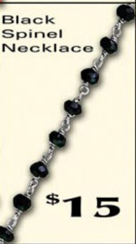
Black Spinel Necklace