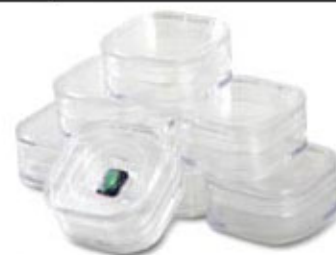
Clear Plastic Boxes. $30 50 Jars in a Box.

Send check or fax us your order with credit card. We accept VISA, Mastercard, AMEX and Discover