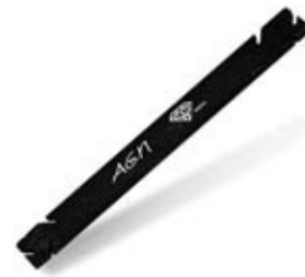
Prong Lifter $10