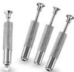
Stone Holders Spring-loaded with contracting wire jaws $3 Each