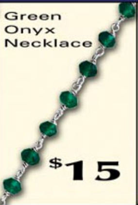
Green Onyx Necklace