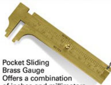
Pocket Sliding Brass Gauge Offers a combination of inches and millimeters. $10