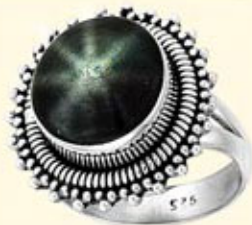
Ladies .925 Star Ruby Sterling Silver Ring