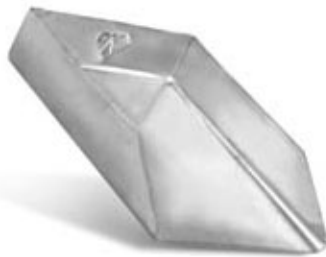
Stainless Steel Scoop $5