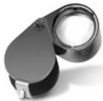
18mm 10 Power Chrome Plated Loupe $25